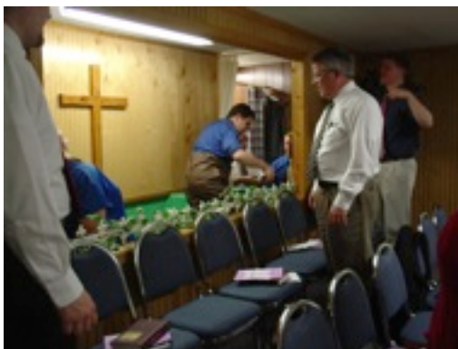
12 Men Students Practicing Baptism