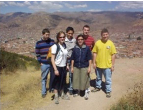
Students in La Paz, Bolivia During Missions Internship

The internship program will be served in a local church, under an approved veteran pastor. The student will be assigned tasks and given instruction by the local church pastor. Each day will be filled with diligent study and practical service, and the student will be exposed to real-life applications of ministry.