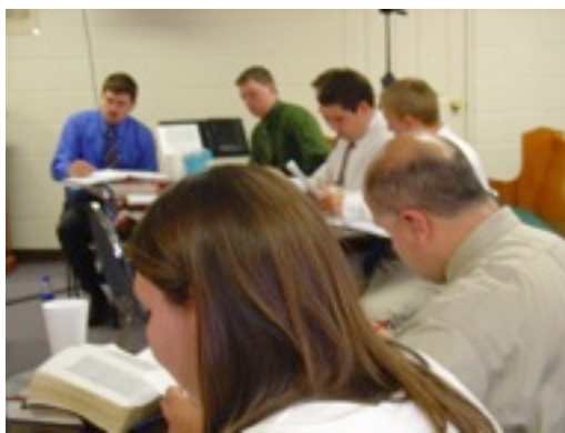
Baptist History Module

Section 13: Abortion - We believe that human life begins at conception and that the unborn child is a living human being. Abortion constitutes the unjustified, unexcused taking of unborn human life. Abortion is murder. We reject any teaching that abortion of pregnancies due to rape, incest, birth defects, gender selection, birth or population control, or the mental well-being of the mother are acceptable (Job 3:16; Psalm 51:5; 139:14-16; Isa. 44:24; 29:1,5; Jer. 1:5; 20:15-18; Luke 1:44).